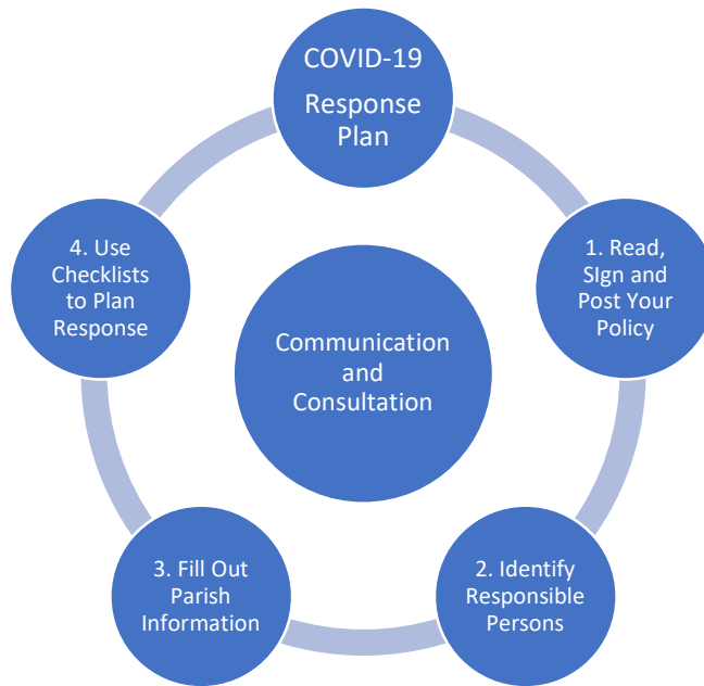
Figure 1 – COVID-19 Response Plan 4 Step Process